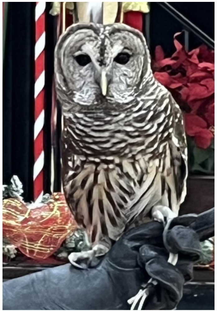
Florida Barred Owl, also traditionally known as a "Hoot Owl," from its song, "Hoo-Hoo-Too-Hoo." The Barred Owl is almost as large as a Great Horned Owl but doesn't have tufted (ear) feathers. It usually feeds on small mammals, it will also eat frogs, toads and salamanders.