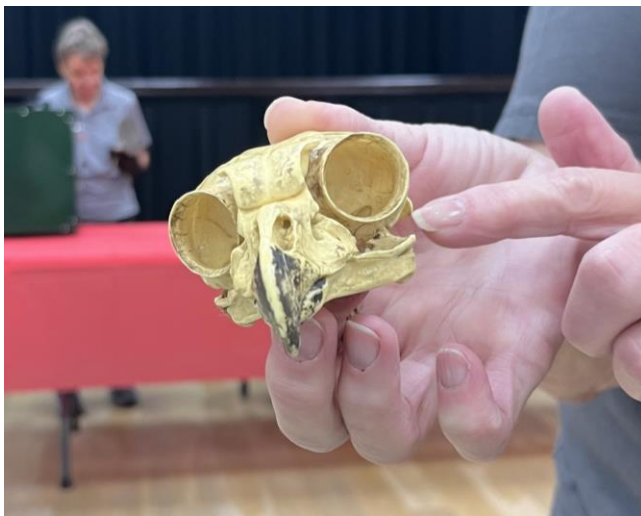
The skull photos are of a great horned owl. It was shown to the audience to get a perspective of how large the eyes are. Typically, an owl's eyes are a third of the size of its head.