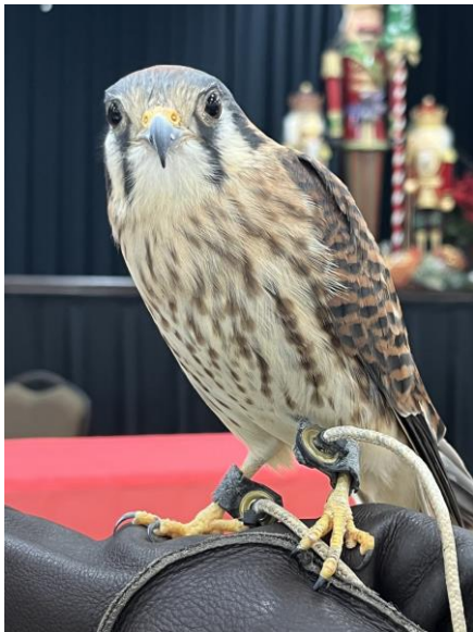
This North American Kestrel once called a "Sparrow Hawk," because of its small size, about as big as a Blue Jay. But it's an excellent hunter and can hover like a helicopter over its prey, without the assistance of the wind.