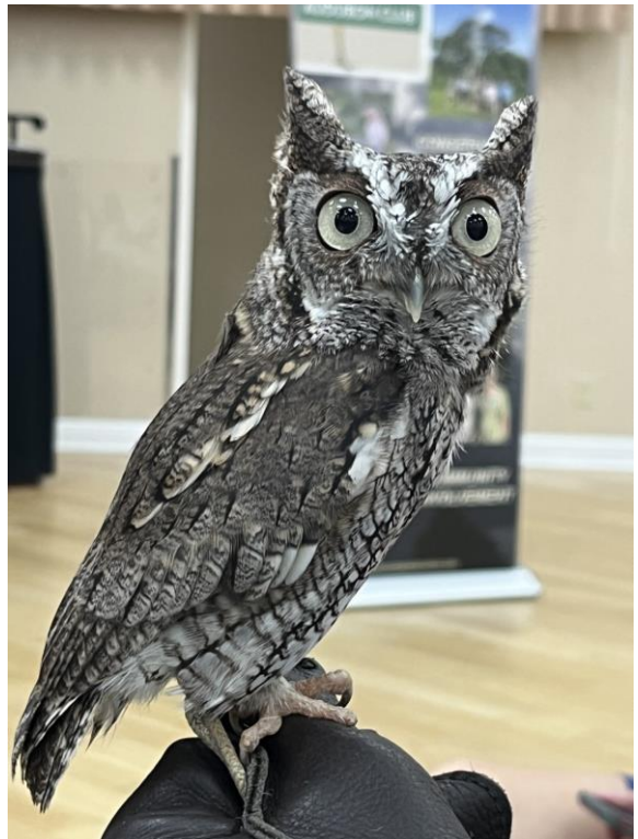
Gray Morph Screech Owl looks like a miniature sized Great Horned Owl. It's not much bigger than a Starling and weighs in at a whopping 4 ounces. The word "Morph" refers to a birds' color phase. With the Eastern Screech Owl, there are typically the red and gray plumage varieties.